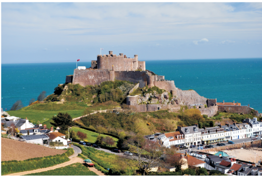
Mont Orgueil Castle

This map is thematic featuring general information. No right of way is indicated by this map. No loss or damage caused by the use of this product will be accepted. Information correct at the time of going to press. © Copyright