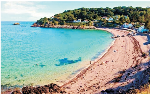
Anne Port Bay